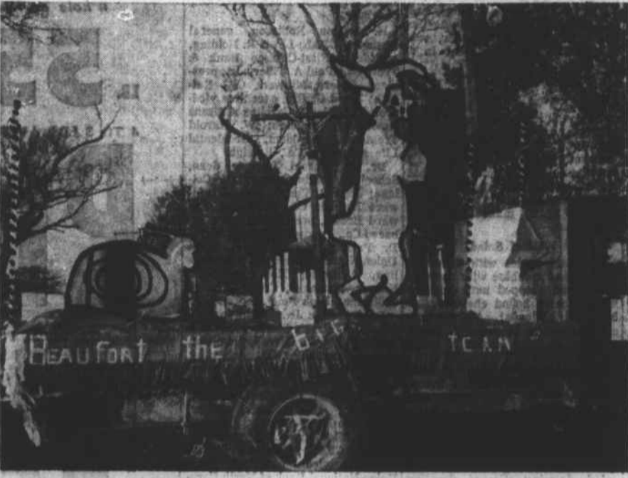
This float, built by the eighth graders, shows Beaufort's football team as the rabbit. Following at the end of the float is Farmville, designated as a snail. The float was prognostic. Beaufort won 12-6.