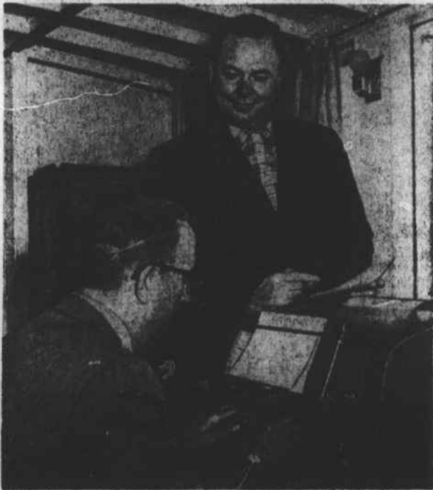
Muscat dictates telegrams over teleprinter circuit. Operator is called in at peak docking point to take messages.

"I wouldn't trade my job with any landlubber at twice the salary," she says.