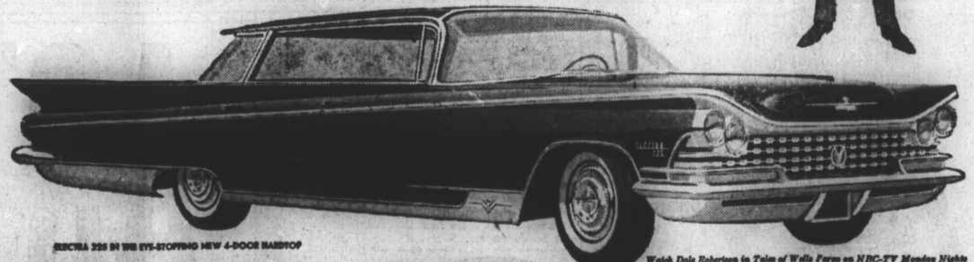
BUICK'S 228 IN THE EYE-STOPPING NEW 4-DOOR HARDTOP

*Optional at extra cost on certain models.