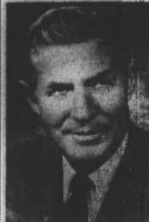
Sen. Mike Monroney, Oklahoma Democrat, will be the speaker at Kitty Hawk tomorrow at the 55th anniversary celebration of the first flight.