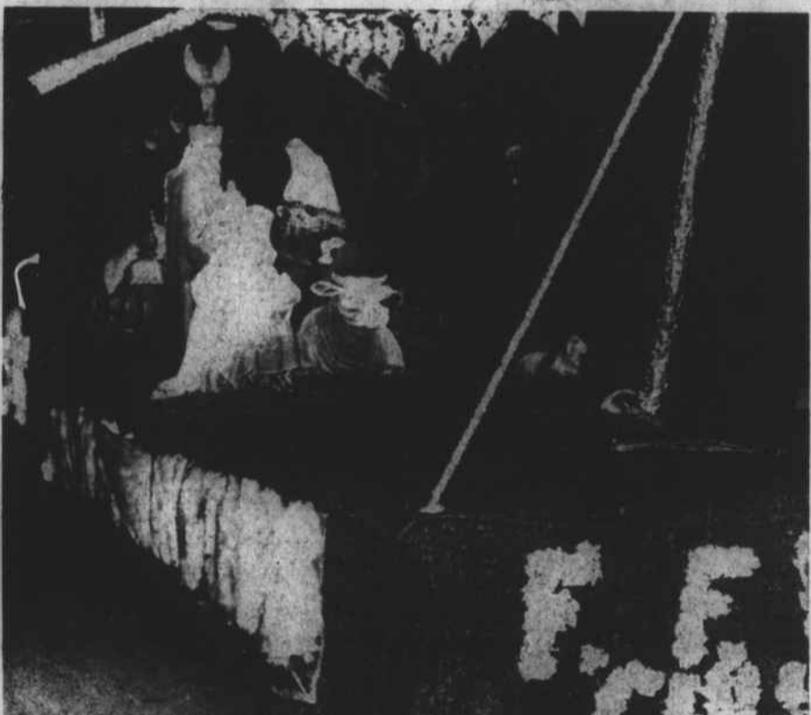
The Beaufort Free Will Baptist Church entered a nativity scene as a float and won a prize of $25 in the Christmas parade Friday at Beaufort.