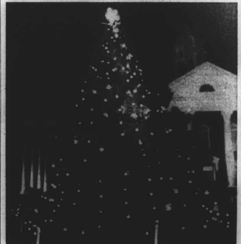
A big living cedar becomes a Christmas tree once every year on the courthouse lawn. It is decorated by Beaufort firemen. (More pictures page 6).