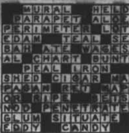
Solution to Friday's Puzzle