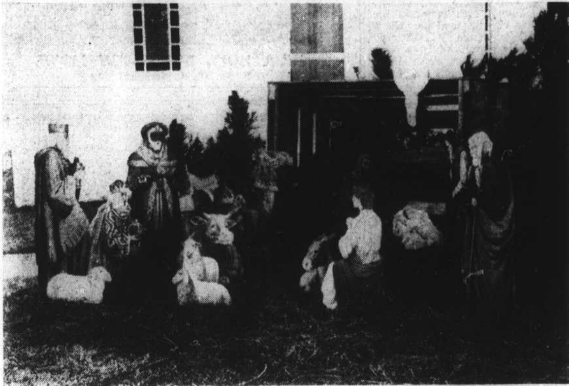
Figures on the lawn of the First Free Will Baptist church, Beaufort, depict the adoration of the Christ child in the manger.