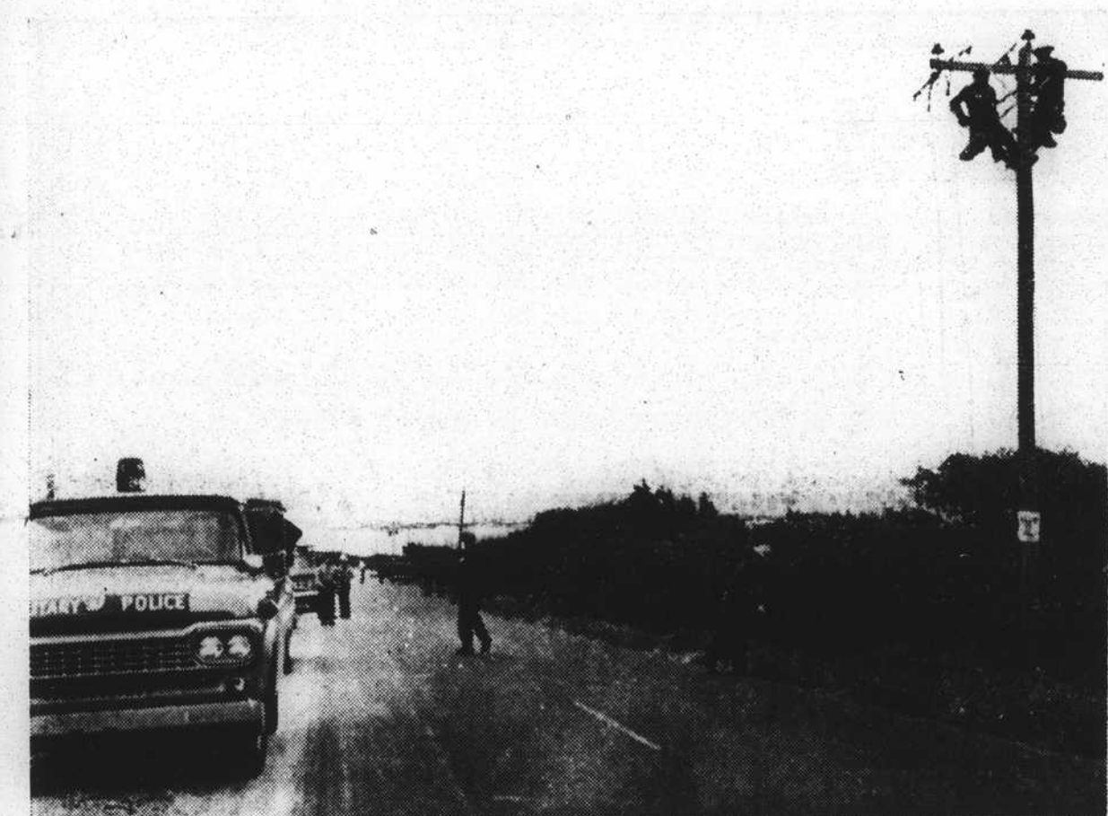
Power line crews and military police were at the site of the crash minutes after it occurred. Crewmen on the pole at right repair lines to restore power. This is a view on the Salter Path road, looking toward Atlantic Beach.

reporter at the scene said, "Yes, I heard the fishermen were so Witnesses on the pier at the time scared they all starting speaking