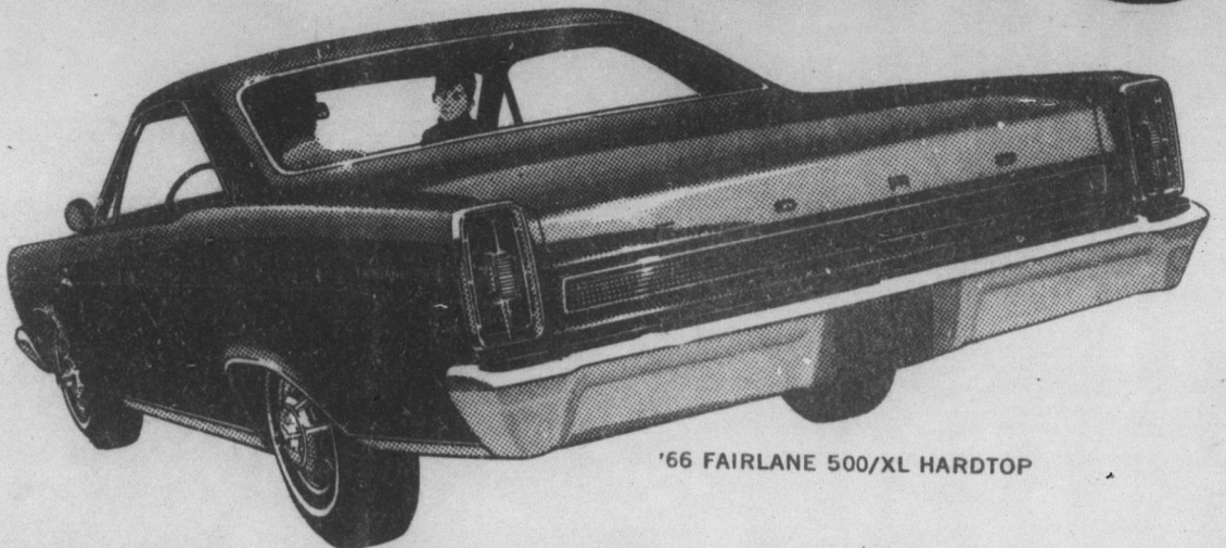
'66 FAIRLANE 500/XL HARDTOP