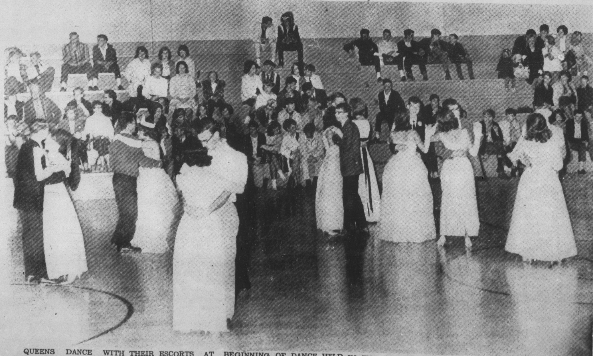
QUEENS DANCE WITH THEIR ESCORTS AT BEGINNING OF DANCE HELD IN THE SCHOOL GYMNASIUM AS PART OF THE HOMECOMING ACTIVITIES