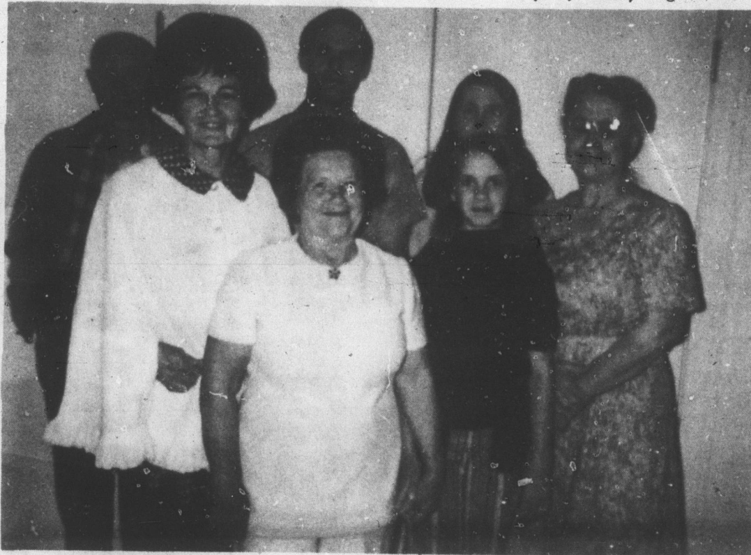
Members of Jack's Creek Community Club At Regular Meeting