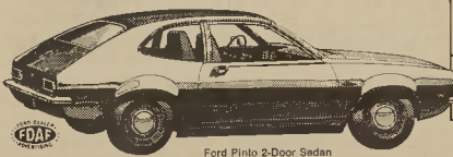
Ford Pinto 2-Door Sedan

See our Pintos and Mavericks ...priced up to $346* less than competition!