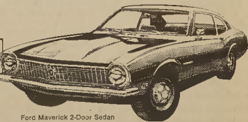
Ford Maverick 2-Door Sedan

Better service...at your Carolina Ford Dealer