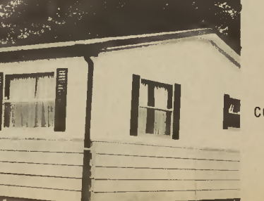
24 x 57 COBURN SECTIONAL HOUSE

OUR SECTIONAL HOUSE OWNERS ARE PROUD OF THEIR HOME FROM A & U