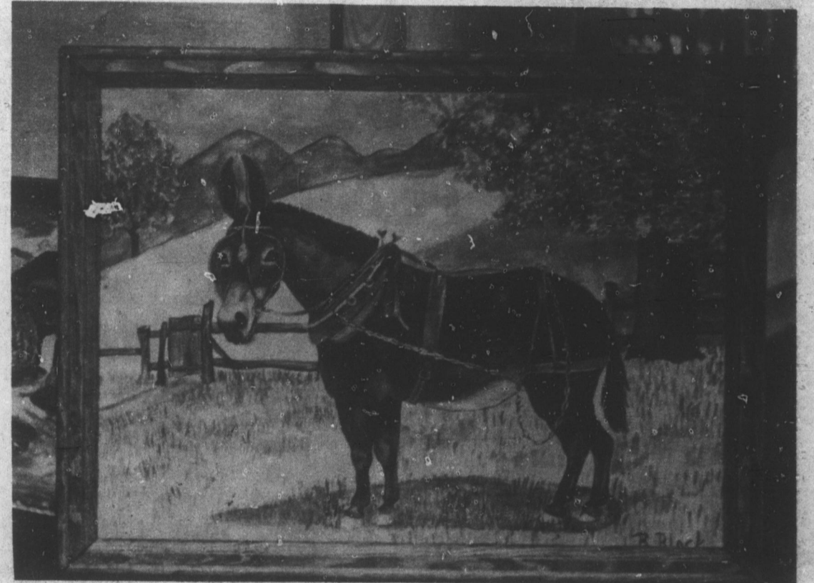
Watercolor Of Work Mule Ties For Fourth Place At Appalachian Consortium Expo

Age 10-17 1st Place, $50.00, Yancey County Country Store Cloggers (sponsored by The Yancey Journal); 2nd Place in this age group, $25.00, The Dayton Sisters of Green Mountain accompanied themselves