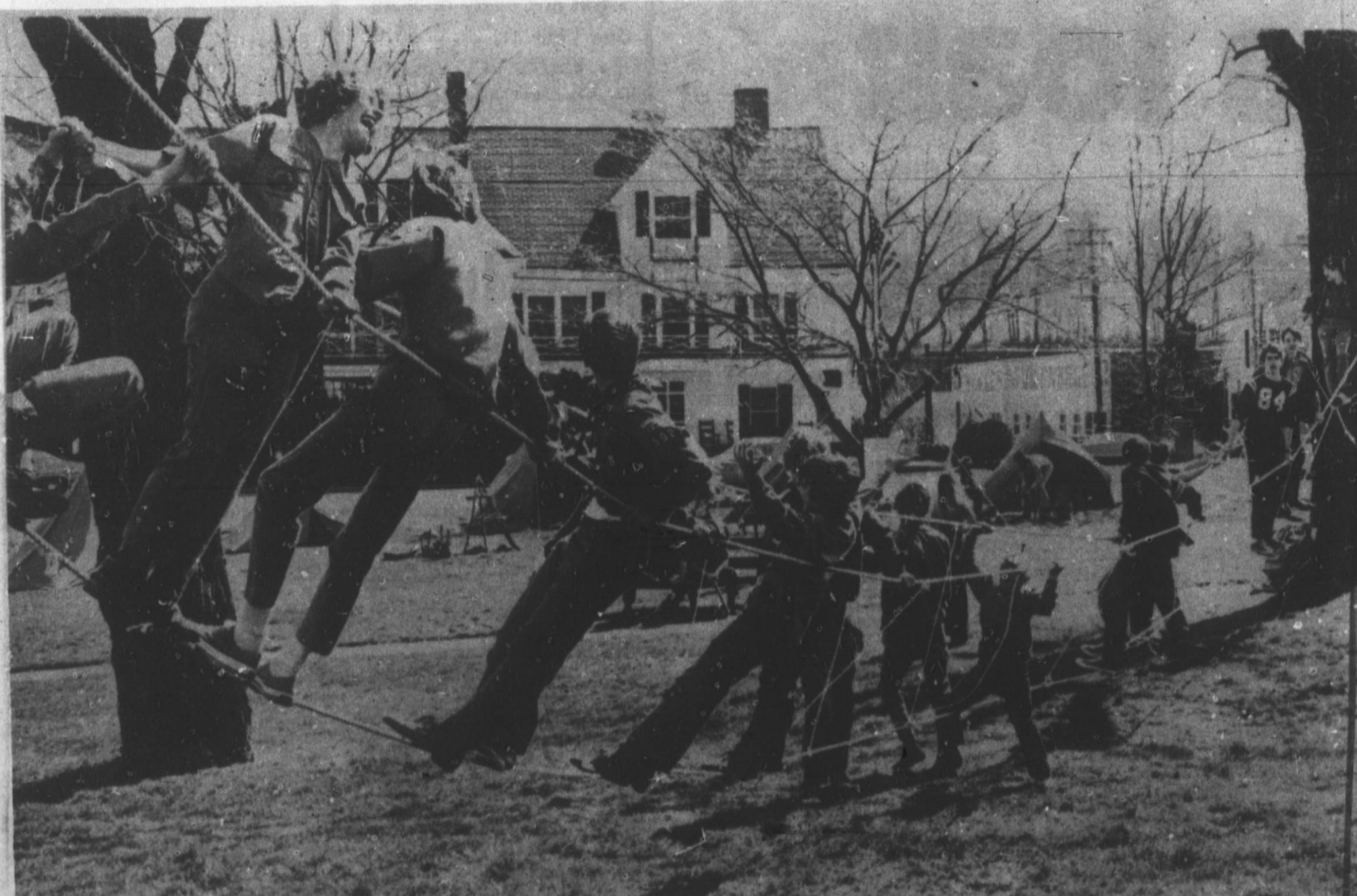
Burnsville Boy Scouts Erect Bridge

In protest at the rising cost of groceries, especially meat, the Burnsville Woman's Club would like to go on record to the effect that it's members have unanimously decided to boycott meat, and refuse to purchase meat and all its by-products during the entire week of April 1-8, 1973.