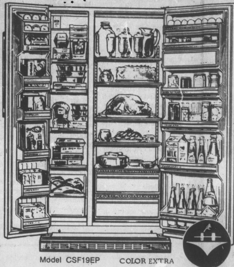
Model CSF19EP COLOR EXTRA

This Hotpoint 19 cu. ft. Food Center is only 30-1/2" wide!