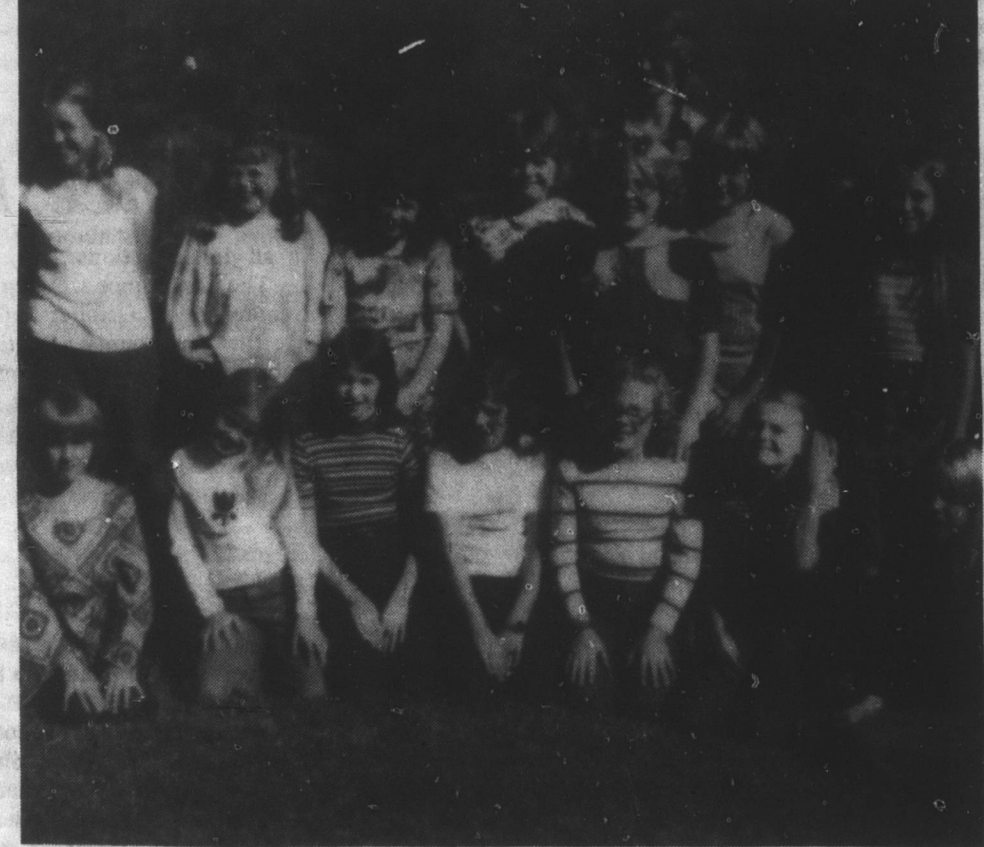
Junior Girl Scout Troop 488 Registers