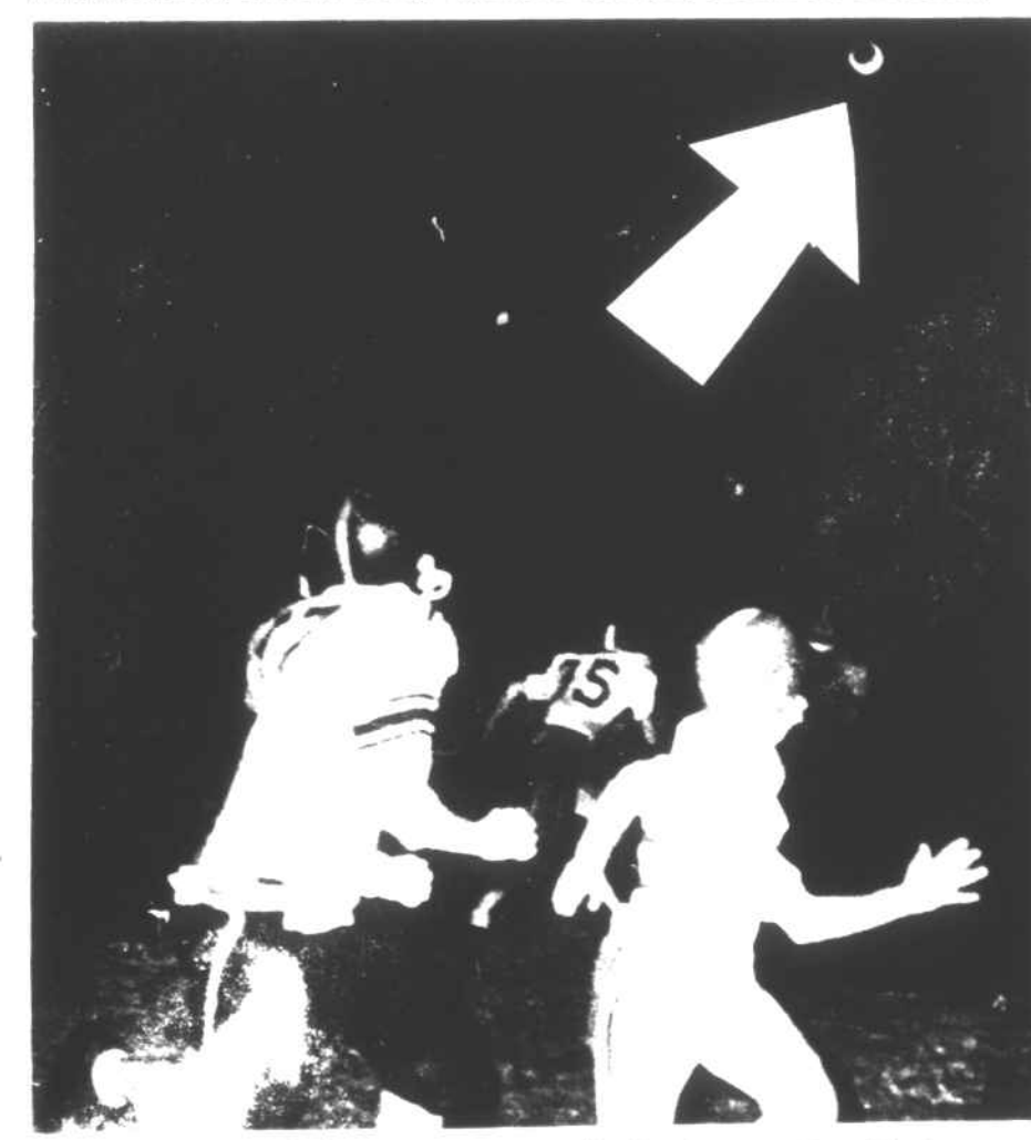
IN SNOW goes deep for one of Van Horn's passes.