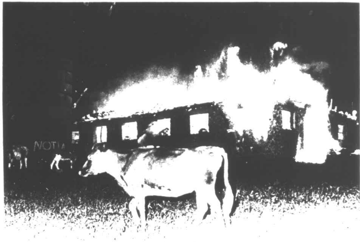
HURDY COWS kept their heads down as flames leapt up from the burning barn.