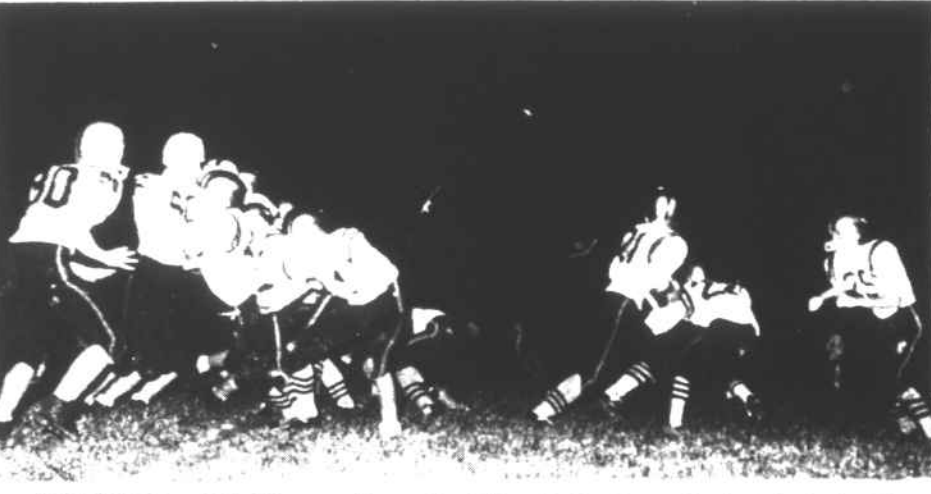
HAYESVILLE - Bill Thurman, Hayesville Yellow Jacket Quarterback, fades back with good protection to toss a 30 yard pass to wingback Tommy Davenport. Sylva Webster won the game 31-7. Thurman completed 9 of 17 passes for 108 yards.