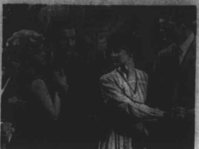
Elvis Presley rebuffs the help and love offered by Millie Perkins, his childhood sweetheart, as "Wild In The Country," 20th Century-Fox Cinemascope DeLuxe Color drama of rebellious youth.

HENN Thur., Nov. 2, MEIN KAMPE Fri. & Sat. Nov. 3 & 4 Double Feature, MANTRAP & SITTING BULL, Late Show, MOST DANGEROUS MAN ALIVE. Sun, Mon. & Tue. Nov. 5, 6 & 7 TAMMY TELL ME TRUE Wed. & Thurs. Nov. 8 & 9 LET NO MAN WRITE MY EPITAPH. MURPHY 64 DRIVE IN Fri. & Sat. Nov. 3 & 4 Double Feature, THE STEEL CLAW & GUN FIGHT. Sun, Mon & Tue. Nov. 5, 6 & 7. WILD IN THE COUNTRY. VALLEY DRIVE IN Fri. & Sat. Nov. 3 & 4. Double Feature, THE REVOLT OF THE SLAVES & THE GAMBLER WORE A GUN. Sun. & Mon. Nov. 5 & 6 LOVE IN A GOLDFISH BOWL