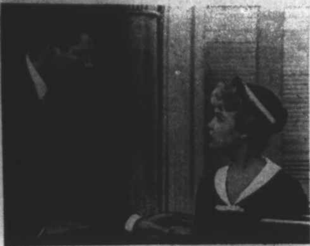
College professor John Gavin questions young Sandra Dee in this courtroom scene from "Tammy Tell Me True," in which the pair are co-starred. The romantic color comedy is a Ross Hunter production for Universal-International.