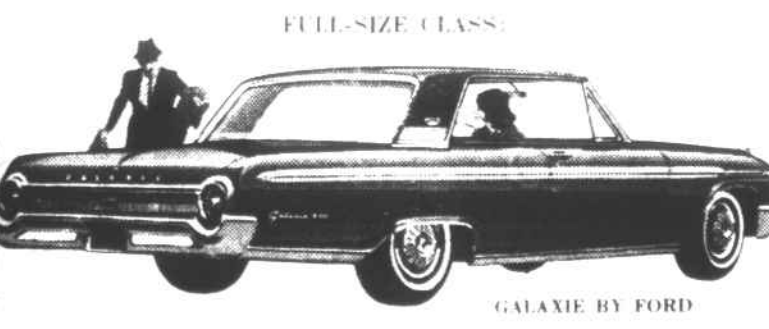
FULL-SIZE CLASS: GALAXIE BY FORD The class for families who want big car comfort, performance and prestige. Value leader is the Ford Galaxie, which has every essential feature of far costlier fine cars. With the optional Thunderbolt 390 V-8 engine, a Galaxie will outperform America's most expensive luxury cars. Requires servicing only twice a year, or every 10,000 miles.