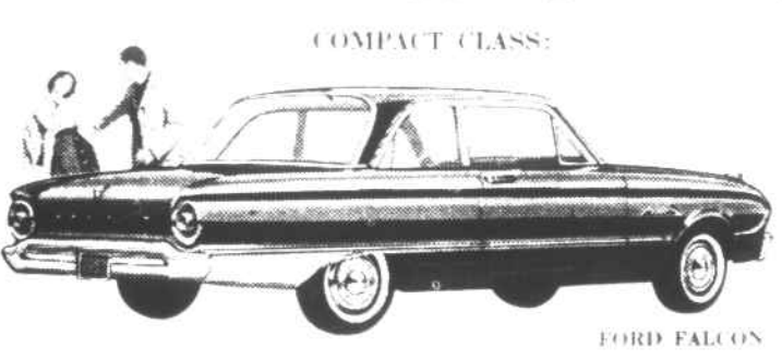
COMPACT CLASS: FORD FALCON This class includes cars that are compact, economical. Most popular by far in million-dollar sales. Ford Falcon is America's lowest priced 4-door sedan, and is a car rated for Sixty or Eighty in last spring's Motor magazine. Buy a Falcon and you have a choice of 13 models including the Falcon and new Falcon Squire wagon.