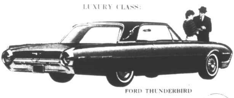
LUXURY CLASS: FORD THUNDERBIRD The top class cars for people who want the very finest. First of the trim-size luxury cars, the 4-passenger Thunderbird is the most distinctive car in this class. Its styling set the trend for an entire generation of cars and now finds a new elegance in the Landau. And Thunderbird's performance is just this side of flight.