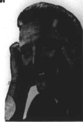
starting in "LONELY ARE THE BRAVE" a Joel Production released by Universal-International

Kirk Douglas* presents Gifts Dads Want Most