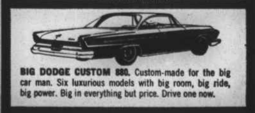
BIG DODGE CUSTOM 880. Custom-made for the big car man. Six luxurious models with big room, big ride, big power. Big in everything but price. Drive one now.