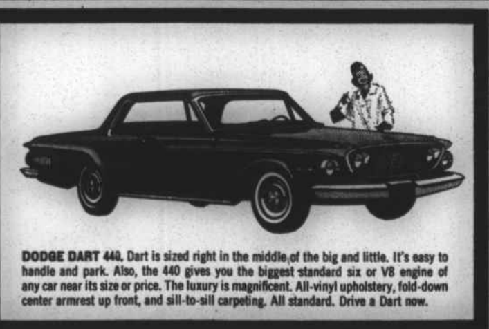
DODGE DART 440. Dart is sized right in the middle of the big and little. It's easy to handle and park. Also, the 440 gives you the biggest standard six or V8 engine of any car near its size or price. The luxury is magnificent. All-vinyl upholstery, fold-down center armrest up front, and sill-to-sill carpeting. All standard. Drive a Dart now.

SENSATIONAL SUMMER SAVINGS! Our new car sales are soaring and we're passing the savings on to you. We've got a Dodge in every size to suit you. A DIVIDEND DEAL on every Dodge in stock -- high-line, low-line, right down the line. Now's the time to save during DODGE DIVIDEND DAYS! It's never been easier to own a new Dodge. See us today.