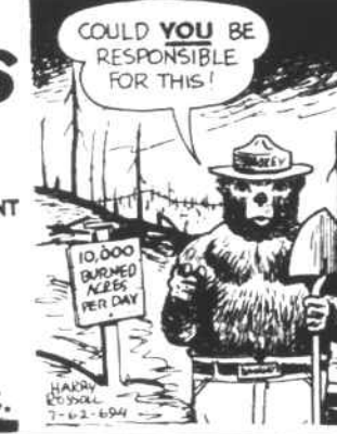
COULD YOU BE RESPONSIBLE FOR THIS!