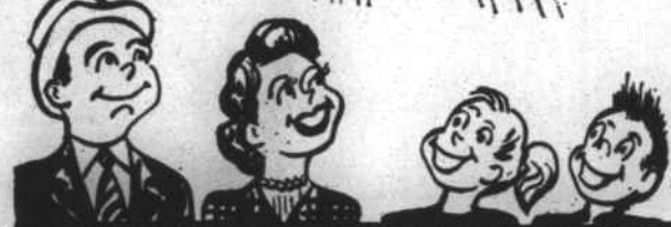
Murphy's Christmas Lights Will Be Turned On Thursday Night at 6 p.m.

GIRL SCOUTS HONOR THE PAST SERVE THE FUTURE