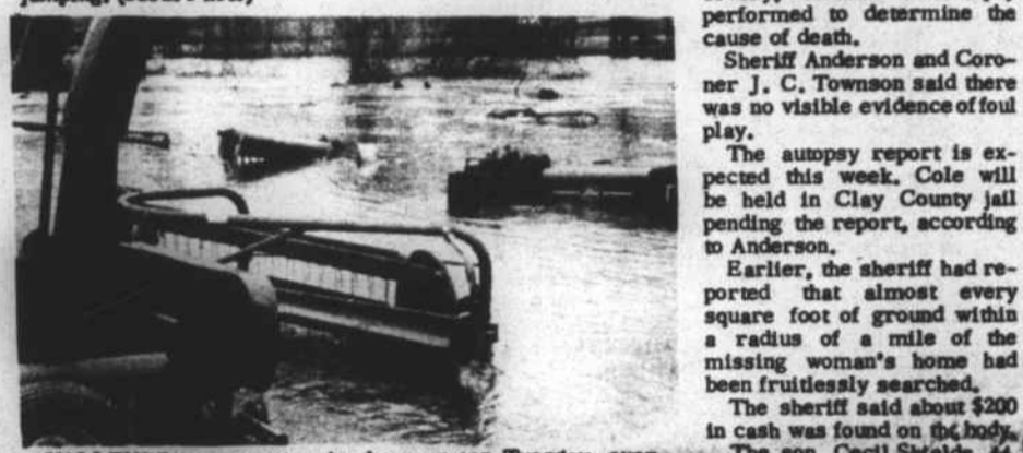
VALLEY RIVER, swollen by heavy rains Tuesday, overflowed its banks Wednesday, March 6, flooding lowlands near Murphy. Here farm equipment at the Wilson Tractor Co. on the Andrews Highway was caught in the surging currents of the overflowing river around 9 a.m. Wednesday.