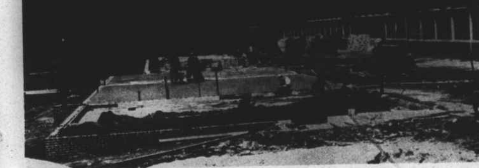
HIGH SCHOOL 30 DAYS 'AGO - School was still in session when the floor was poured for the Murphy High School's new lunchroom and home economics classrooms. This end of the building will house the kitchen and lunchroom. The classrooms will be located at the far end.