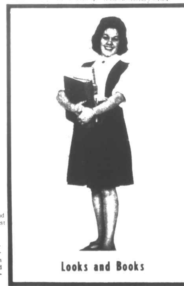
Looks and Books