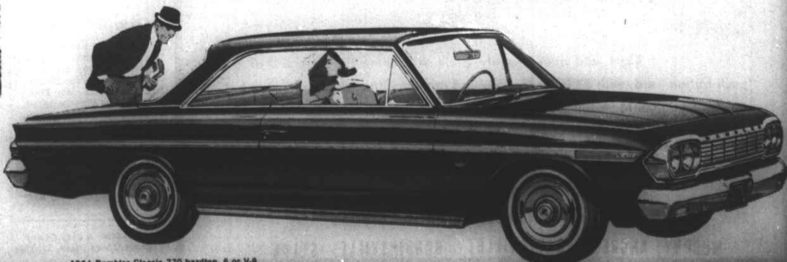
1964 Rambler Classic 770 hardtop, 6 or V-8

RAMBLER AMERICAN • RAMBLER CLASSIC 6 or V-8 • RAMBLER AMBASSADOR V-8