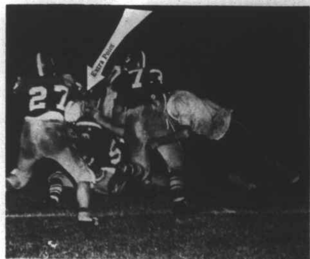
EXTRA POINT means the difference as Halfback Jimmy Cole plunges over for the PAT in Murphy's opener with Copper Basin to win with a score of 14-13.