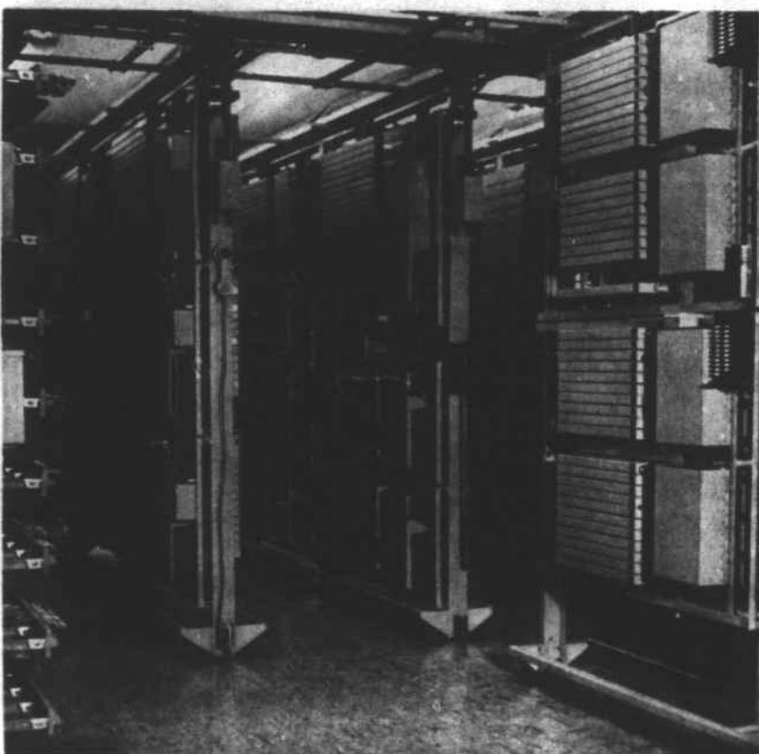
Intricate array of electronic equipment.