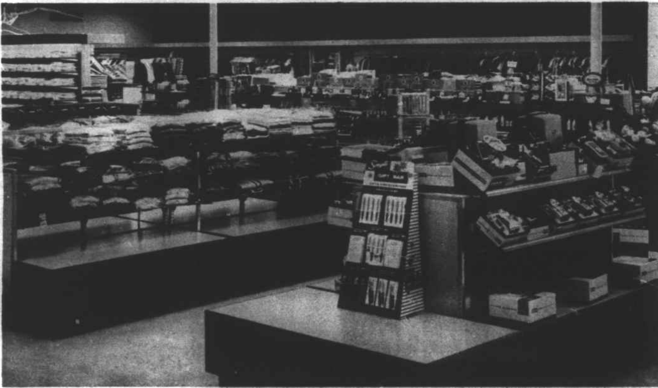
Men's & Ladies Clothing Department