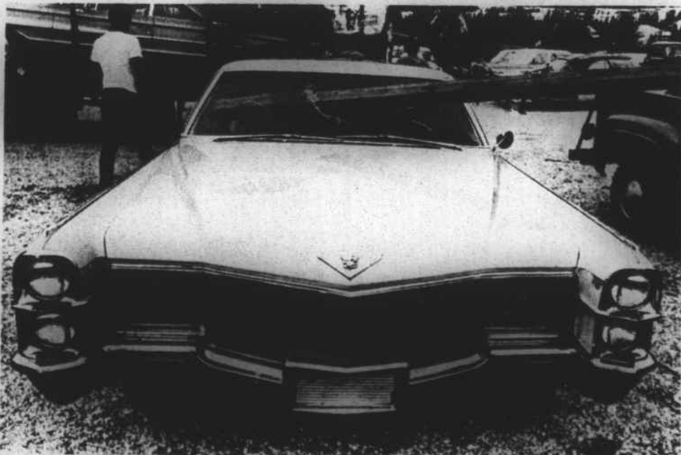
Cadillac at B&W Motors...winds put timber through windshield