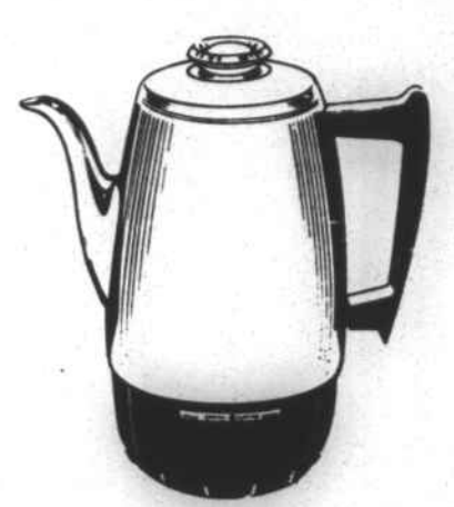
Model CM10 COFFEE MAKER