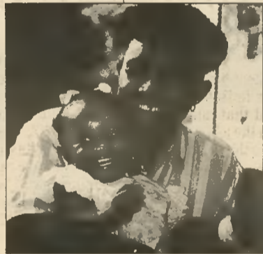
Roanoke Island Historical Association ▶

"Capital Consortium has provided the experienced direction and objective guidance needed to assist The Lost Colony in reaching its long-term endowment goal."