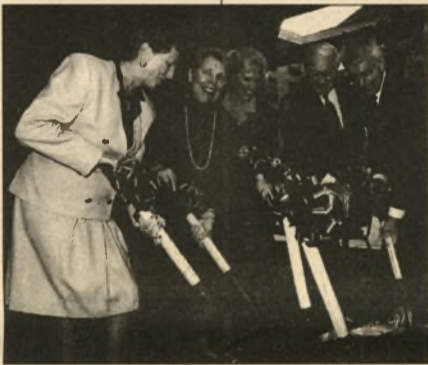
◀ Lewis Rathbun Wellness Center

"The counsel we received from Capital Consortium's staff was sound and practical. Without their help, it would have been more difficult to raise the money in our given time frame."