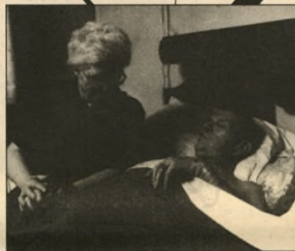
◀ Triangle Hospice

"Capital Consortium's staff has particular expertise in North Carolina and its leadership. This has been especially beneficial to our campaign effort."