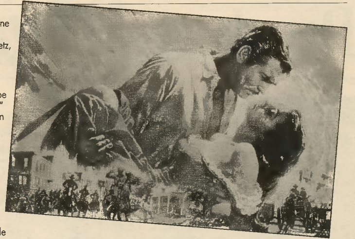
"Gone with The Wind" is showing at the N.C. Museum of Art in Raleigh on April 29 at 7 p.m. and April 30 at 1 p.m. Admission is $3. (919) 833-1935.