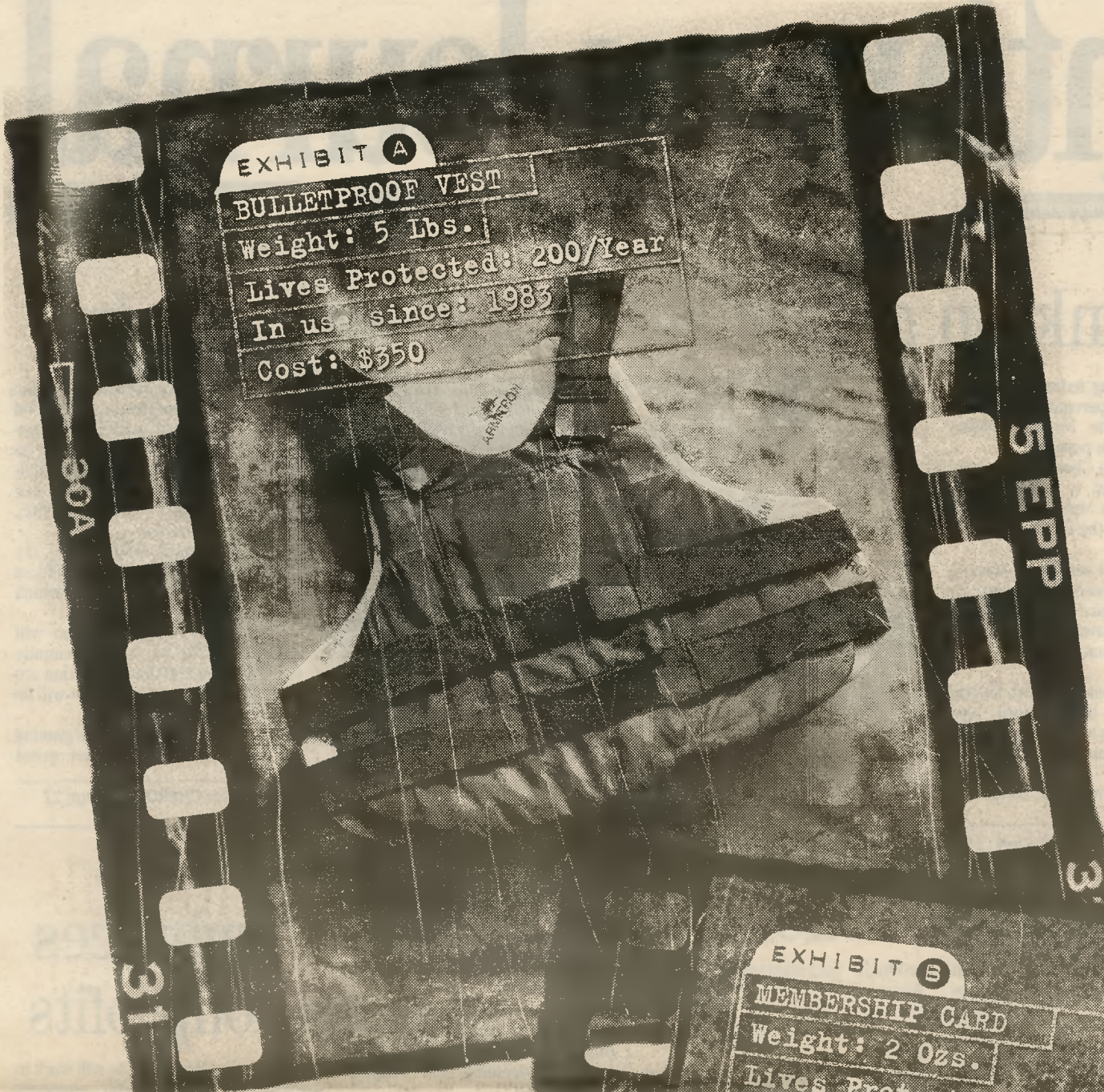
EXHIBIT A BULLETPROOF VEST Weight: 5 Lbs. Lives Protected: 200/Year In use since: 1983 Cost: $350