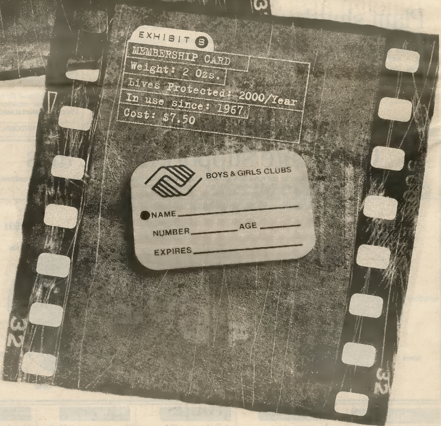
EXHIBIT B MEMBERSHIP CARD Weight: 2 Ozs. Lives Protected: 2000/Year In use since: 1967 Cost: $7.50

EXHIBIT A BULLETPROOF VEST Weight: 5 Lbs. Lives Protected: 200/Year In use since: 1983 Cost: $350