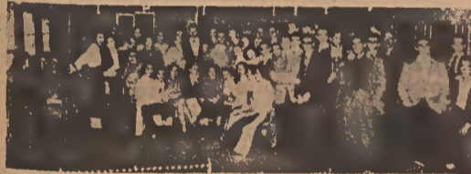
Above are shown a portion of the enthusiastic group of young boys and girls athletes at the banquet given in their honor. Aside from the athletes invited guests were sponsors and cheerleaders of the teams.