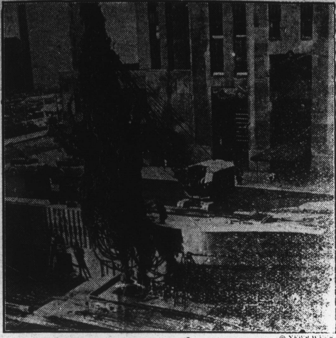
NEW YORK'S GREETING TO SANTA CLAUS

Erecting one of the twin Norway spruces, towering 70 feet above a sunken plaza, which twinkle with 2,000 colored electric lights beneath the shadow of the 61-story skyscraper dominating Rockefeller Center. An outdoor skating rink opens Christmas day at their base.