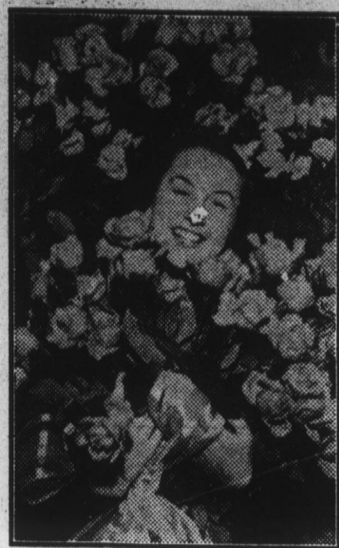
PACIFIC COAST BEAUTY