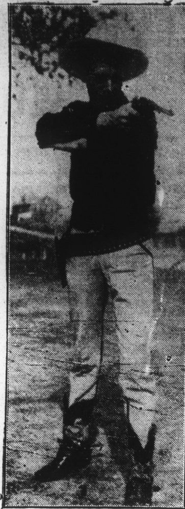
With The Rio Grande Rangers At The Dolly Madison Theatre February, 22nd and 23rd

ANOTHER! Yes, another opportunity to obtain a useful and beautiful free premium. The Times is extending the fountain pen and pencil offer. See large announcement elsewhere in this issue.