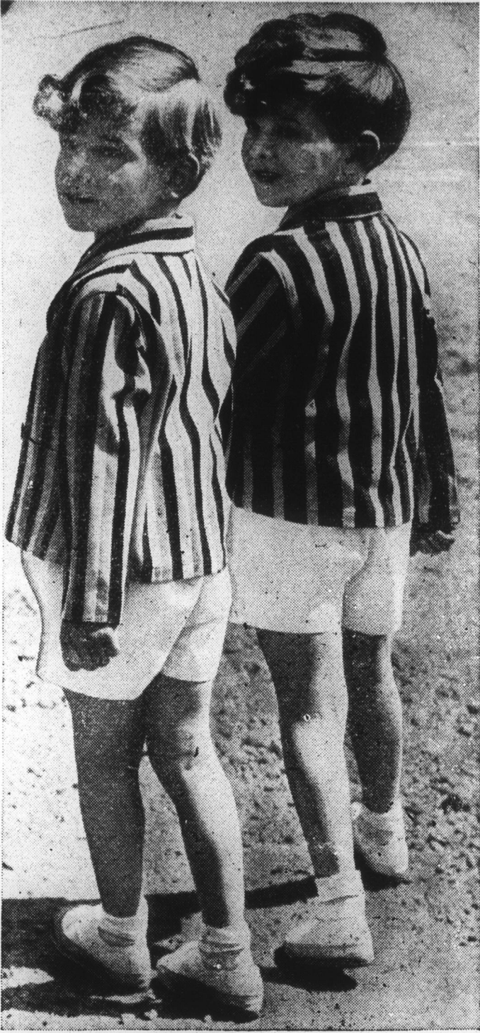
THESE young clubmen-to-be are quite conscious of their charm and well dressed look as they step out in identical Botany flannel blazers, striped in red and white. Very dashing and very masculine. June Harper's Bazaar suggests the blazers to be worn with summer poplin suits of white and regulation low white Hood Rubber sneakers for scuffling small feet.