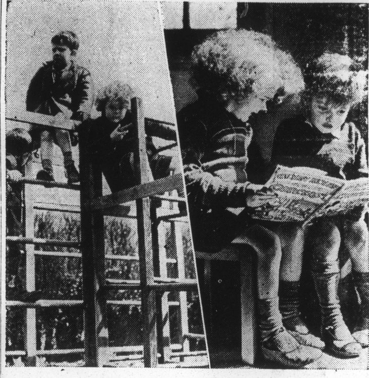
The power of play is credited with helping these children recover rom the effects of bomb shock. At left, children are climbing in the 'jungle gym" at the Anna Freud nursery center in Hempstead, England, naintained by the foster parents plan for war children. Right: British hildren enjoying the adventures of Mickey Mouse.