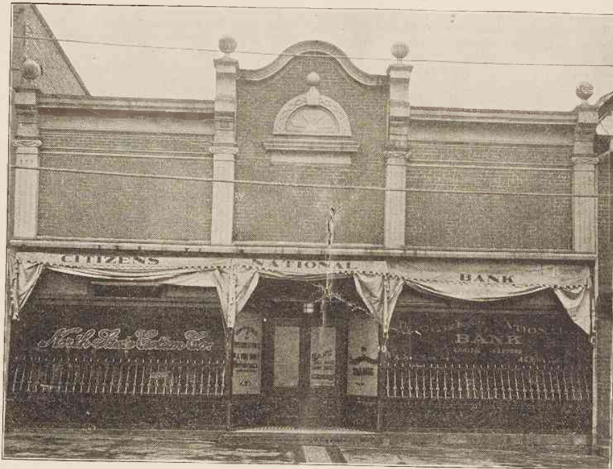
HOME OF THE CITIZEN'S NATIONAL BANK