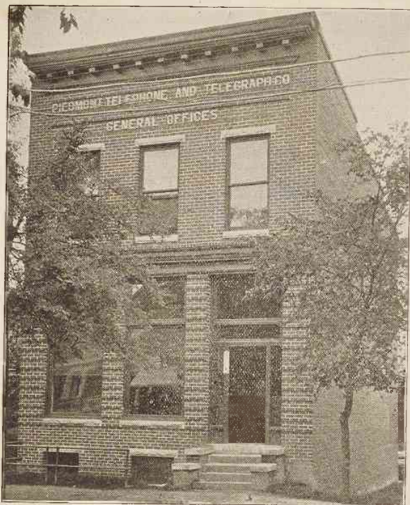
HOME OF THE PIEDMONT TELEPHONE & TELEGRAPH COMPANY