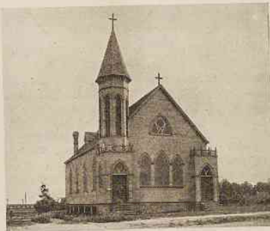
ST. MICHAEL'S ROMAN CATHOLIC CHURCH