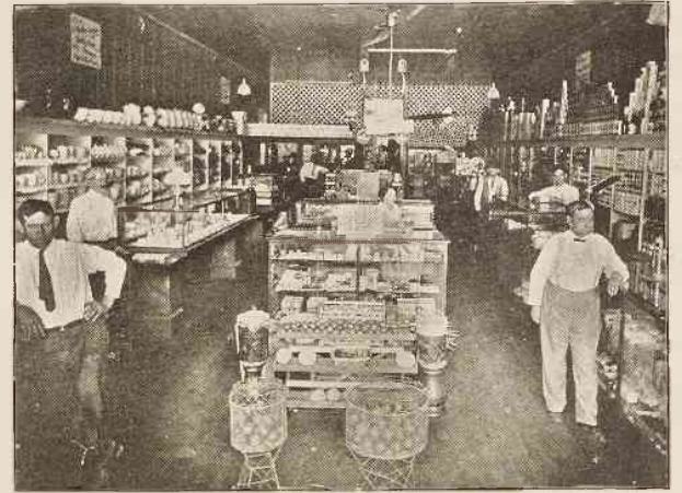
INTERIOR OF THE HARRY-BABER COMPANY STORE