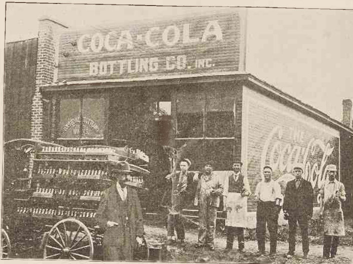
HEADQUARTERS COCA-COLA BOTTLING COMPANY