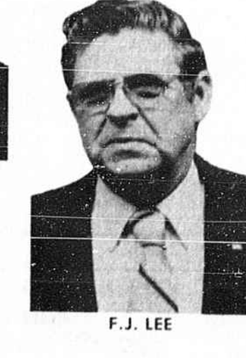
...always ready to serve you!