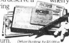
DeLuxe Banking: for $10,000 in a Certificate or $2500 in Regular Savings, nobody puts more muscle in your money.

when you invest $10,000 or more in an NCNB Certificate: DeLuxe Banking.