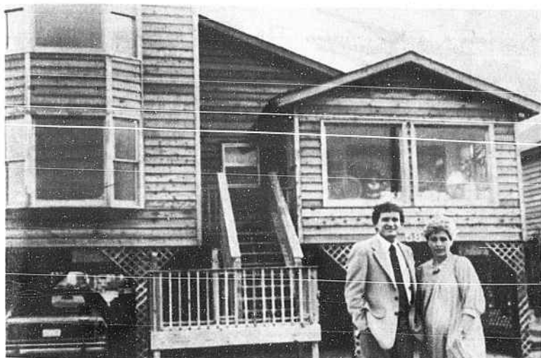
A GROWING FAMILY and a temperamental storm prompted a thorough renovation of the Redwine's coastal home, with a new look inside and out.