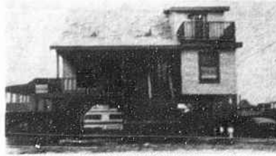
2nd ROW—NEW CONSTRUCTION. 440 Ocean Blvd. West, corner lot. 4 BR, sleeping loft, 2 1/2 baths, immaculately furnished, carpet, vinyl kitchen & baths, central heat/air, concrete underneath. $122,000.

COME AND EXPERIENCE THE BEAUTY OF HOLDEN BEACH WITH ITS FRIENDLY FAMILY ATMOSPHERE!