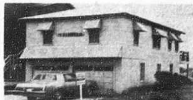
OCEANFRONT—110 Ocean Blvd. East. 3 BR. 2 baths, new furniture, recently remodeled. 55.6 ft. frontage. $122,000.

OUR FRIENDLY STAFF WILL BE HAPPY TO HELP YOU WITH ALL YOUR REAL ESTATE NEEDS.