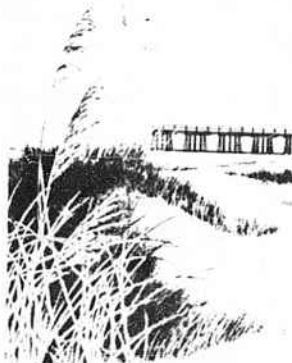
BY THE BRUNSWICK BEACON