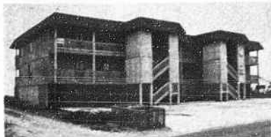
OCEANFRONT—Sea Oats Villas Unit 203. 2 BR. 2 baths, central heat/air, carpet, vinyl kitchen & baths, beautifully furnished. $88,000.