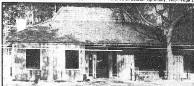
BY THE BRUNSWICK BEACON