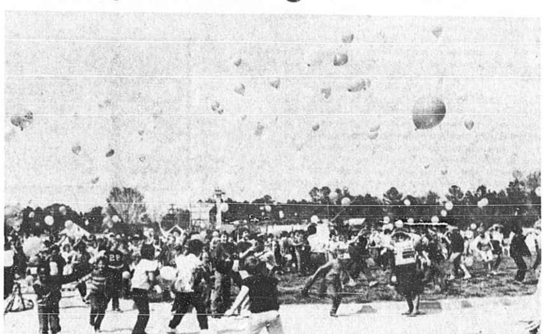
THE LAUNCH provided excitement for everyone as more than 1,100 colorful balloons filled the skies over Shallotte.

Sources of information available at the school libraries include filmstrips, slides, art prints, charts, maps, globes, audiotapes, microcomputer courseware, videotapes and models.