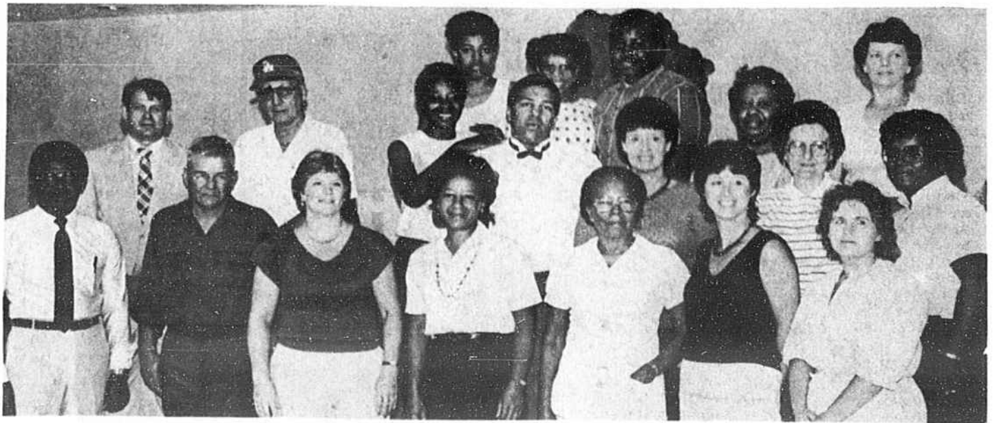
Union PTO Honors Bus Drivers